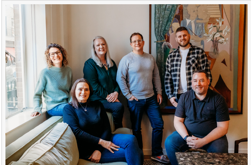
The PayCaptain Team in January 2022.

The list comes at a time when consumers and job-seekers alike are shifting attention towards more planet-friendly, human, and purpose-led companies