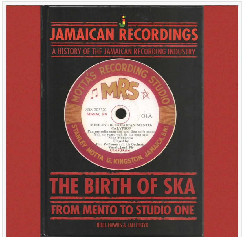
Jamaican Recordings: Book One: A History of The Jamaican Recording Industry Cover

A History Of The Jamaican Recording Industry Vol 1 is also available