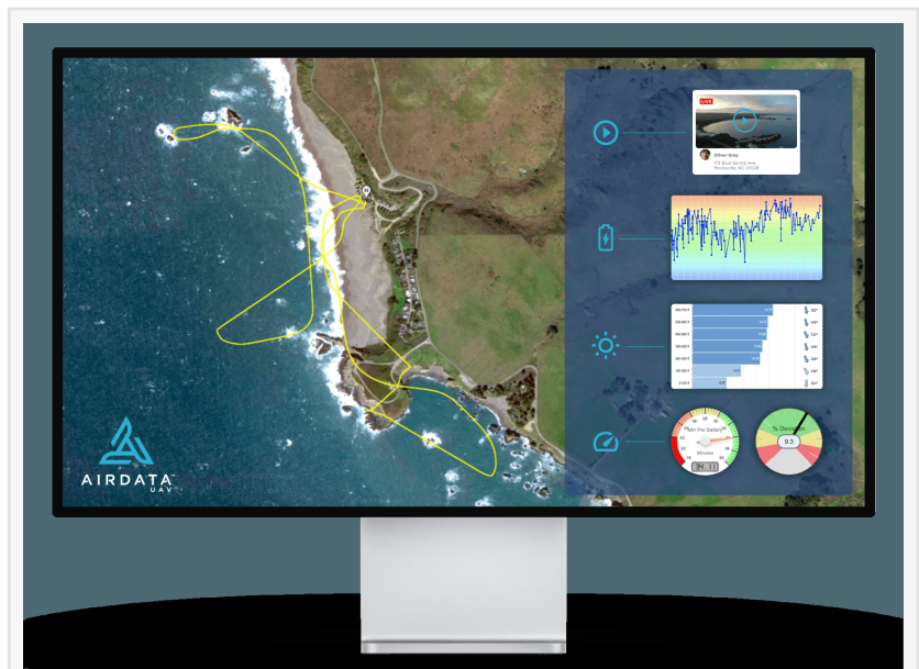
AirData UAV as seen on a monitor