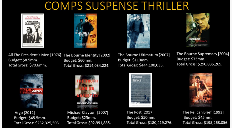
The Six Sides of Truth Pitch Deck Comps