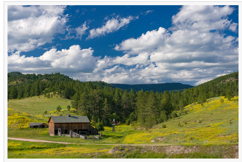
Wyoming Black Hills Living Land

The property is ready for development with the initial infrastructure in place.