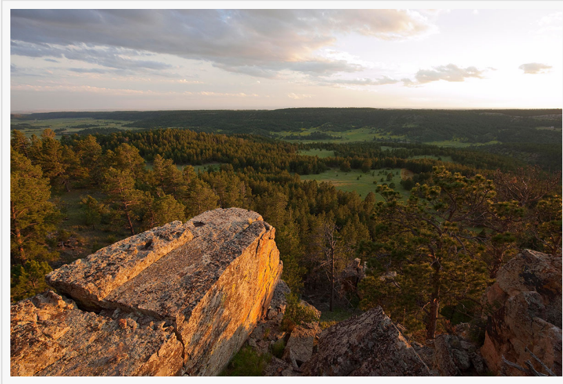
Wyoming Black Hills Living Overlook

Heyn Real Estate is licensed in Nebraska, South Dakota, and Wyoming. Being a realtor in Hot Springs, SD, gives them a central location for all three states, and they can assist you statewide in all three states. Heyn provides professional service and understands the ins and outs of land properties. With over 15 years of agriculture experience, a love of work, drive, and a passion to help others, he takes each listing seriously