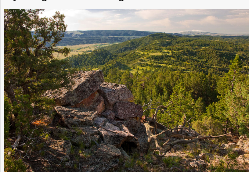
Wyoming Black Hills Living Land Area

From iconic landscape to awe-inspiring views, the property concepts are three-fold: The mountain-top, complete with planned golf course, the mountainside lots, and the two exquisite move-in ready homes.