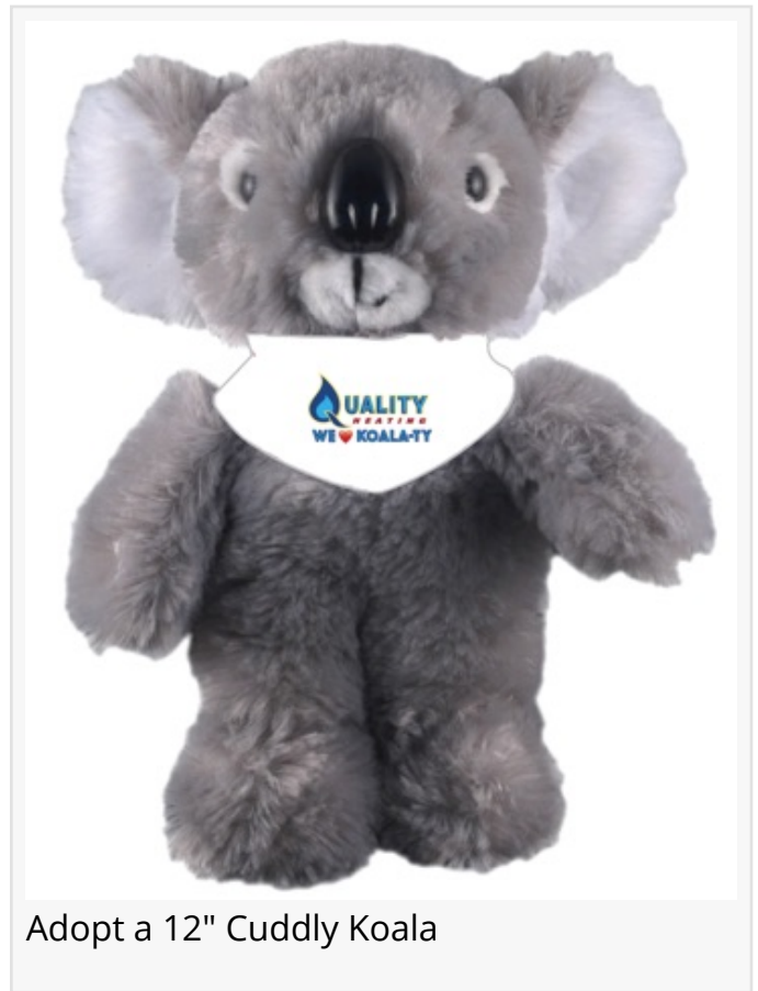
Adopt a 12" Cuddly Koala

Not only will Peninsula Home Expo visitors take home a stuffed Koala bear when they sign up for a "koala-fied" system with Quality, they will also receive "$250 Off" when installed before August of 2022, or an upgraded wi-fi capable controller/thermostat while supplies last.