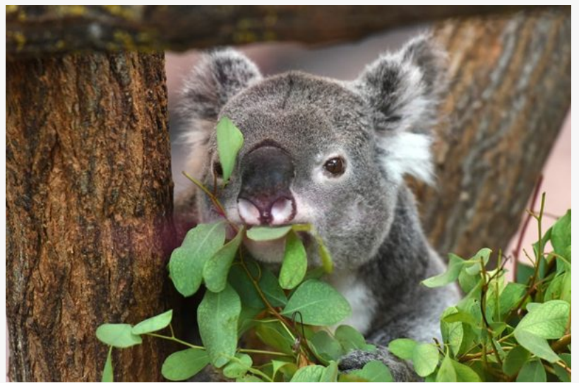
Koala Going Green

This press release can be viewed online at: https://www.einpresswire.com/article/571757306