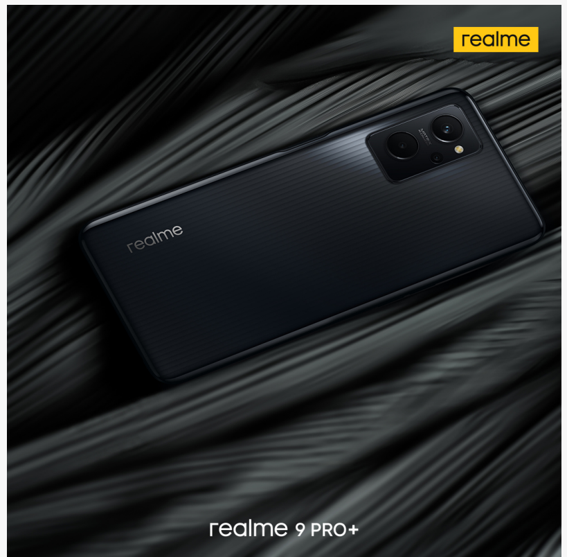
realme 9i phone