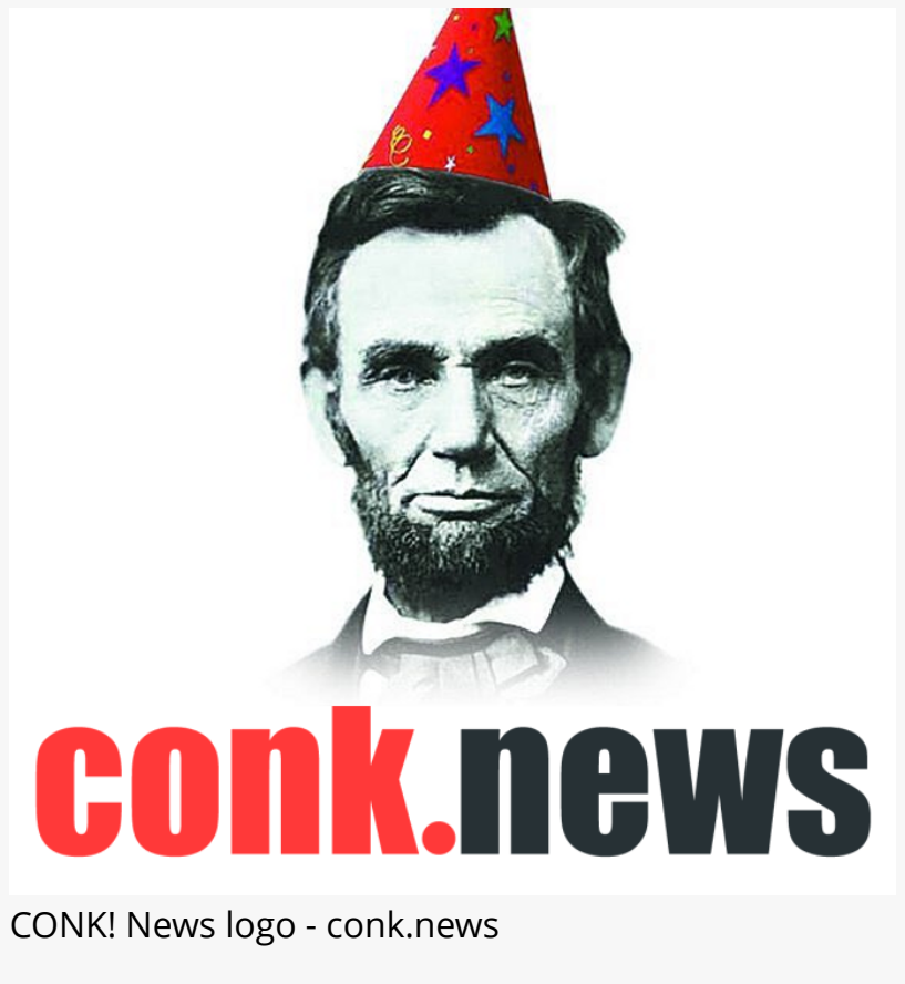
CONK! News logo - conk.news