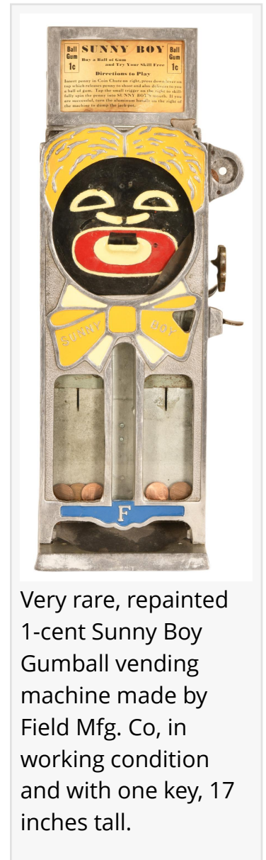
Very rare, repainted 1-cent Sunny Boy Gumball vending machine made by Field Mfg. Co, in working condition and with one key, 17 inches tall.

An early salesman's sample for an S & L Johnson reaping machine in a wooden case, with key, has a great original look and is marked, "S & L Johnson Patent Dec. 8, 1853", rated 8+, 19 ½ inches by 11 inches. Also, an early H. C. Evans & Co. (Chicago) gaming wheel, very heavy, shows images of dice on the wheel and measures a stout 91 inches by 60 ½ inches, rated 7.75.