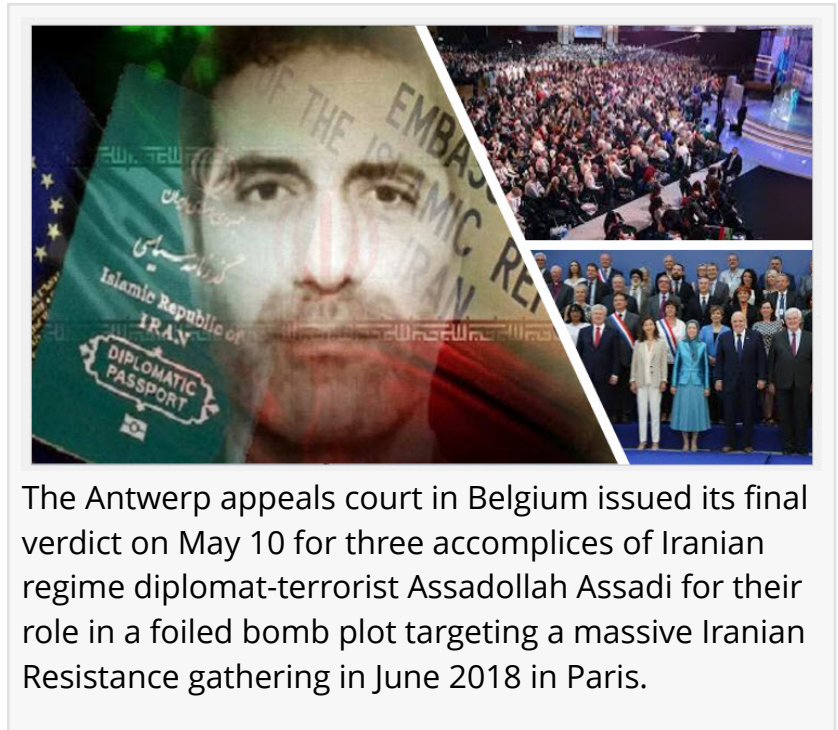
The Antwerp appeals court in Belgium issued its final verdict on May 10 for three accomplices of Iranian regime diplomat-terrorist Assadollah Assadi for their role in a foiled bomb plot targeting a massive Iranian Resistance gathering in June 2018 in Paris.

PARIS, FRANCE, May 13, 2022 /EINPresswire.com/ -- The Antwerp appeal court in Belgium issued its final verdict on May 10 for three accomplices of Iranian regime diplomat-terrorist Assadollah Assadi for their role in a foiled bomb plot targeting a massive Iranian Resistance gathering in June 2018 in Villepinte, north of Paris.