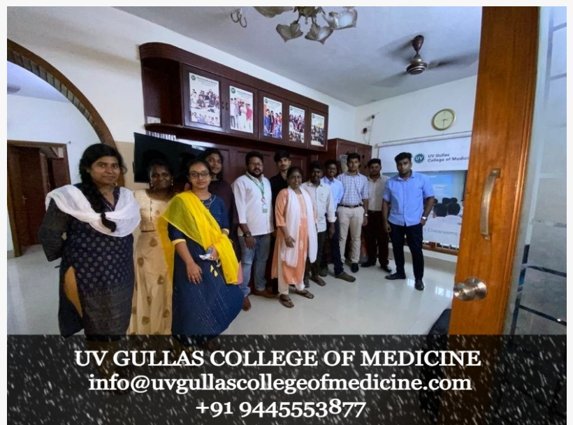
UV-Gullas-College-of-Medicine- Re Entry Students with Director