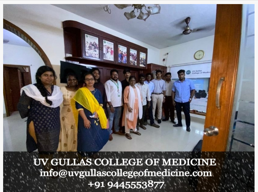
UV-Gullas-College-of-Medicine- Re Entry Students with Director