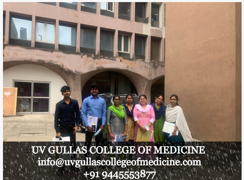
UV-Gullas-College-of-Medicine- Re Entry Students after Submitting Documents for VISA