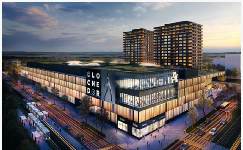
Luxembourg's Cloche d'Or