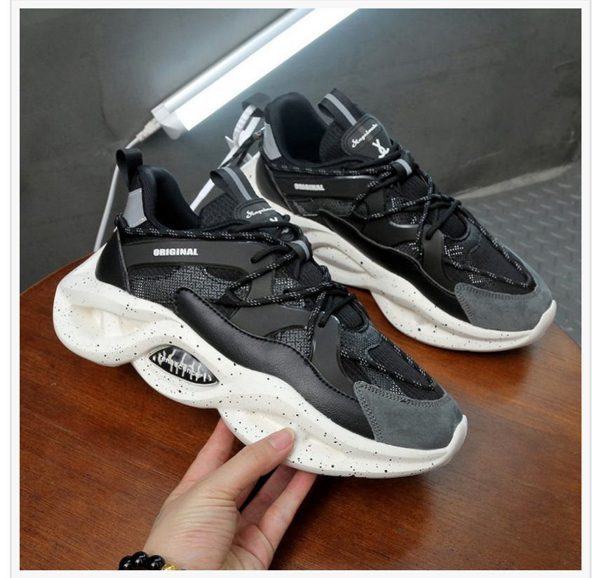
Enzo Footwear Supports Cancer Research

Enzo Footwear is a minority-owned, up-and-coming company that is making great strides in the world of fashion. Their innovative foresight is taking sneaker wearers to another level. They have an innate ability to create unique styles that are a head above the rest. Enzo Footwear is customer satisfaction driven, and they strive to bring their customers the highest quality products by closely monitoring the ever-changing market in which they operate. They handpick each design and monitor the manufacturing process. In return, they deliver a seamless product at affordable prices that any quality conscious consumer will appreciate.