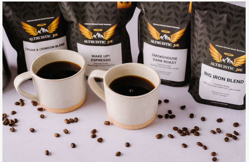
Altruistic Joe Coffee Year Round Blends