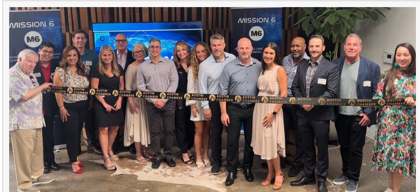
Mission 6 Austin Launch Ribbon Cutting

AUSTIN, TEXAS, USA, May 12, 2022 /EINPresswire.com/ -- Mission 6 held its official company launch on National Technology Day along with the Austin Chamber of Commerce and the Austin Technology Council . Attendees included members from CBRE, Dell, University of Texas, Guaranty Bank, The Austin Chamber, Austin Technology Council, and DivInc, among other business leaders, sustainability professionals, investors and crypto experts.