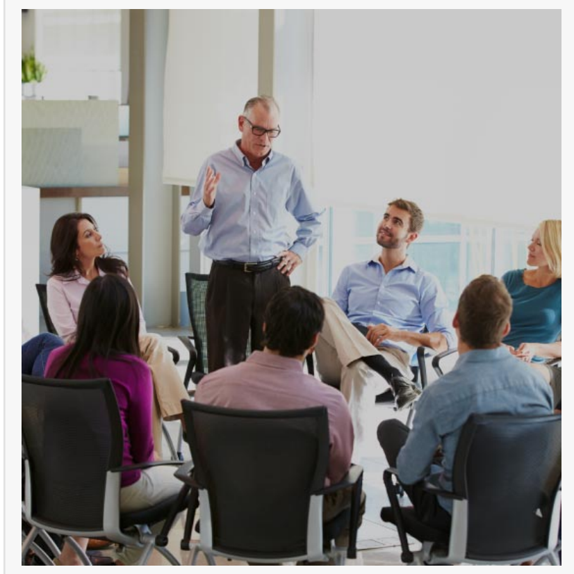
Support people suffering with BPD

training, and support to individuals with BPD, their families, and the professionals who treat them. Borderline personality disorder awareness month is important because it helps people learn about the condition and understand that recovery is possible. There is hope and there are people who care.