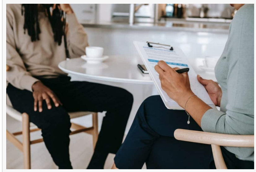
Therapy is the firt line of treatment for BPD

Access to BPD mental health care for everyone