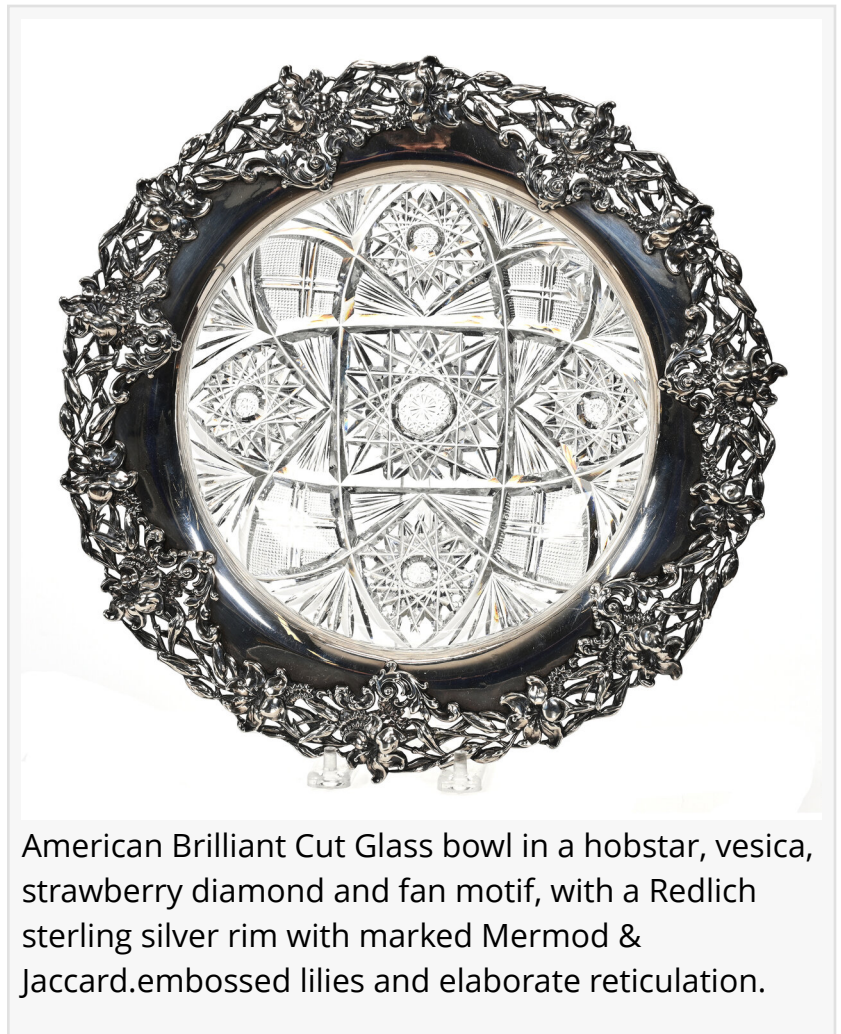
American Brilliant Cut Glass bowl in a hobstar, vesica, strawberry diamond and fan motif, with a Redlich sterling silver rim with marked Mermod & Jaccard.embossed lilies and elaborate reticulation.

Phone bidding will be available for lots with a low estimate of $500 or greater (low estimates are found on LiveAuctioneers.com). Email your phone bid list to info@woodyauction.com by 12 o'clock noon on Wednesday, May 25th, and please include your name, full address, a primary