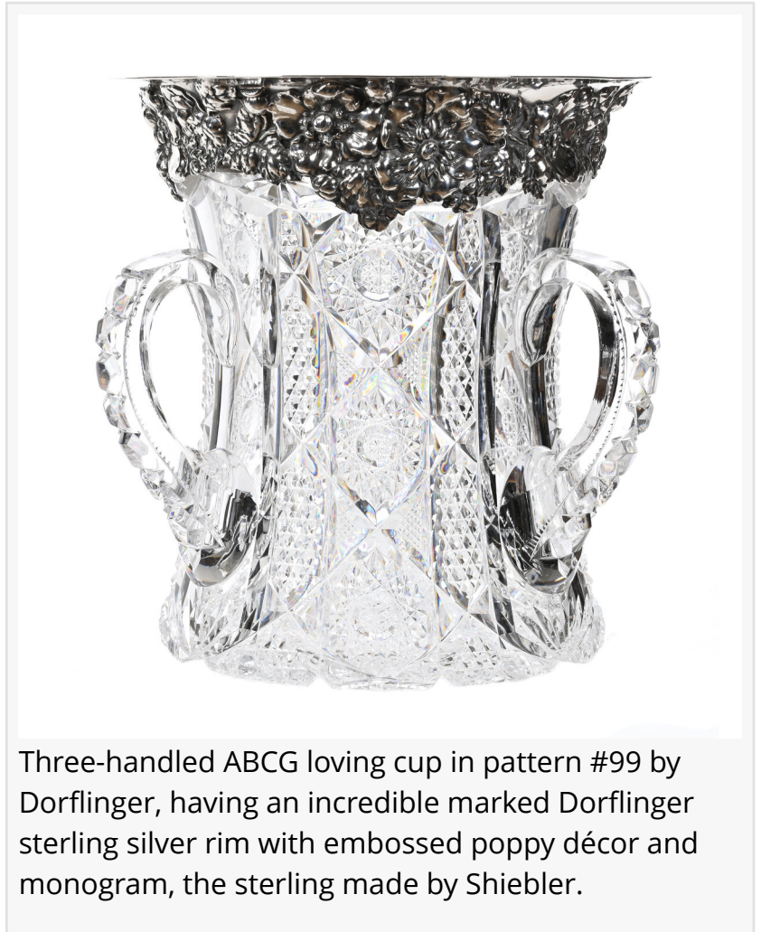
Three-handled ABCG loving cup in pattern #99 by Dorflinger, having an incredible marked Dorflinger sterling silver rim with embossed poppy décor and monogram, the sterling made by Shiebler.