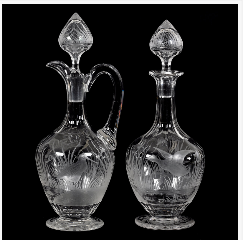
Pair of ABCG decanters signed Sinclair with an engraved game bird décor (both feature a sandpiper and duck in flight), with pattern engraved stoppers. One is handled, 13 inches tall, one has no handle.

Jason Woody Woody Auction +1 316-747-2694 email us here