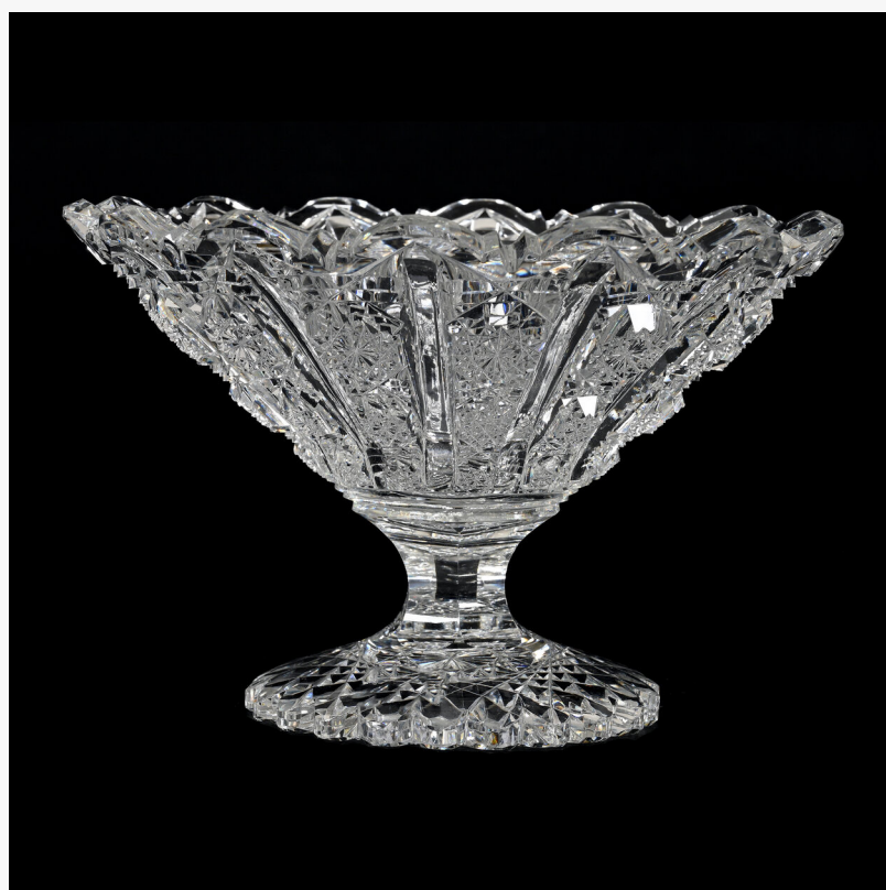
American Brilliant Cut Glass tazza (wide form shallow bowl) compote, signed Hawkes in the Panel pattern, featuring a scalloped hobstar foot and being of exceptional quality.

This press release can be viewed online at: https://www.einpresswire.com/article/572320716