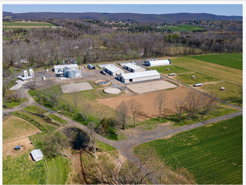
142+/- Acre Vineyard and Equestrian Farm

WASHINGTON TOWNSHIP, NJ, USA, May 13, 2022 /EINPresswire.com/ -- Max Spann Real Estate & Auction Co is pleased to announce the sale of a +/- 142-acre preserved Long Valley Vineyard and Equestrian Farm located on Old Turnpike Road in the Long Valley Area of Washington Township, Morris County, New Jersey. The property will be sold in an online only Auction concluding Thursday, June 16, 2022 at 11:00 a.m. Bidders may bid on their computer or through the Max Spann phone app.