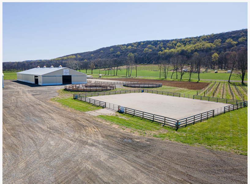
Indoor & Outdoor Riding Arenas