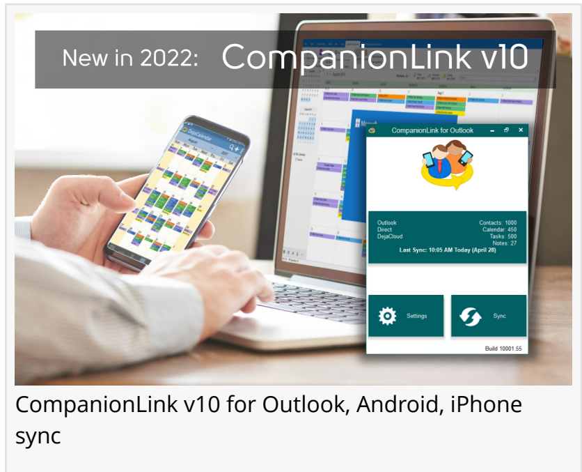
CompanionLink v10 for Outlook, Android, iPhone sync