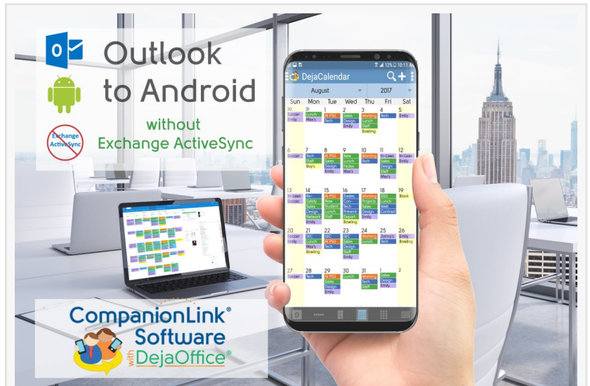
CompanionLink for Outlook and Samsung Galaxy

Also, in CompanionLink v10 is updated 64-bit Outlook logic. This change recognizes that Outlook installs 64-bit by default, and so this is now handled as native for CompanionLink. Additionally, to ease some issues with Wi-Fi and Bluetooth sync , CompanionLink now uses Google's Firebase and FCM ID to assist in pairing your phone to your PC. Finally, v10 has new drivers for Microsoft Graph API drivers to ensure a more secure connection to Microsoft Teams, Exchange and other Microsoft Windows 11 and Office 365 platforms.