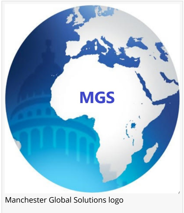
Manchester Global Solutions logo

WASHINGTON, DC, DISTRICT OF COLOMBIA, UNITED STATES, May 16, 2022 /EINPresswire.com/ -- In June 2022, Manchester Global Solutions and DL Johnson Consulting Agency will lead an international delegation from the United States, the Caribbean, South and Central America, Europe, and from Africa to attend the African Investors Council (AIC) International African Agriculture Food and Industry Summit on June 15th -19th to Istanbul, Turkey. They will be present to play an active role in this summit by representing the Western Hemisphere, contributing to the expansion of innovative technologies concerning agriculture, agriculture systems, agri-foods, agri-business and supporting renewable energies on the African continent. AIC and its members are supporting Africa's agriculture by contributing through agreements, measures and transfers of know-how, skills, education, vocational training, and investors to bring about long-term employment of the local population in African countries.