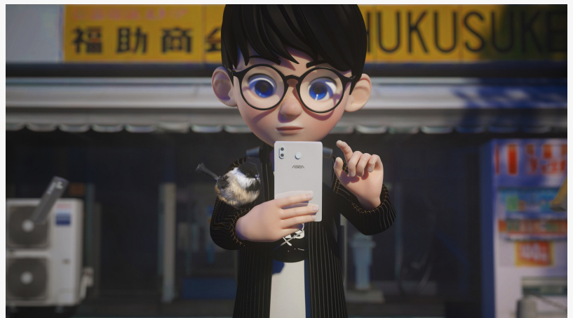
Scene from Connection