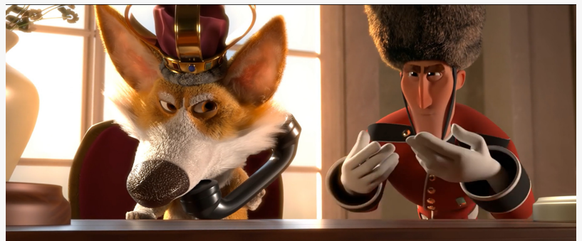
Scene from Barking Orders