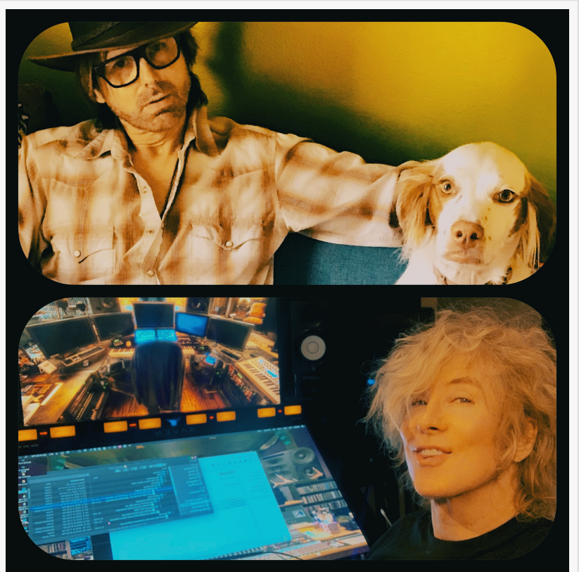
Chip & G of "All in your head"

This press release can be viewed online at: https://www.einpresswire.com/article/572562093