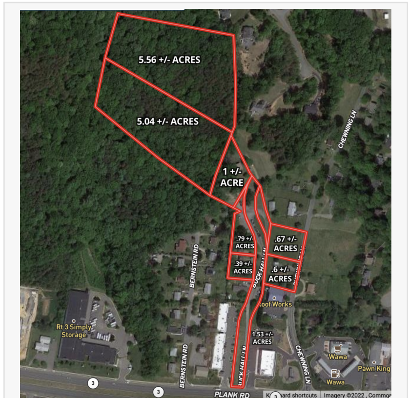
Buck Hall Lane, Fredericksburg, VA

Tuesday, May 24 at 2PM -- Auction conducted at 12116 Chewning Ln., Fredericksburg, VA 22401 – For addresses and highlights of