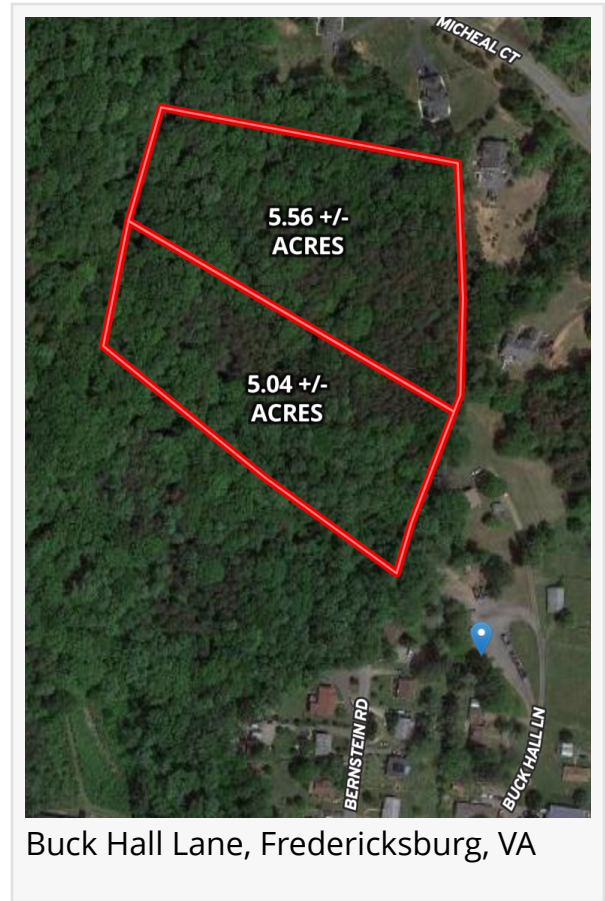
Buck Hall Lane, Fredericksburg, VA

The real estate auction is open to the public. Brokers are reminded that pre-registration is required for compensation.