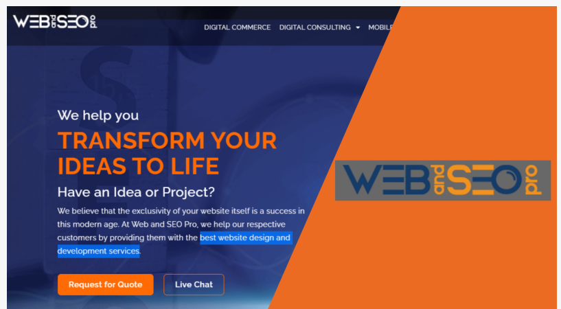
Web and SEO Pro Cover Image