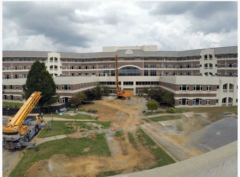
James H. Quillen VAMC