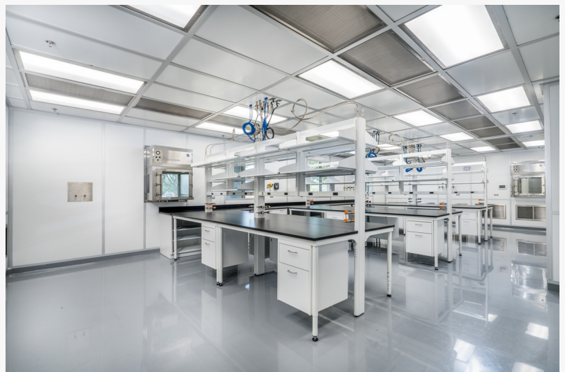
Asteroid Curation Facilities