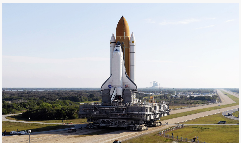
NASA Mobile Launch Platform