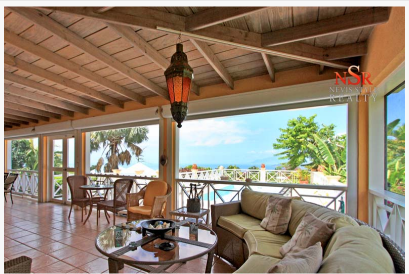
Caribbean Home - Nevis

There are three types of residency to consider – Temporary, Annual and Permanent. While Temporary Residency doesn't allow you to work on-island, Annual grants permission for you to work in any business you desire. It's a tempting option for anybody considering changing their life and moving to the Caribbean, where lunch breaks can be far more about sand and sea than a sandwich snatched at a desk.