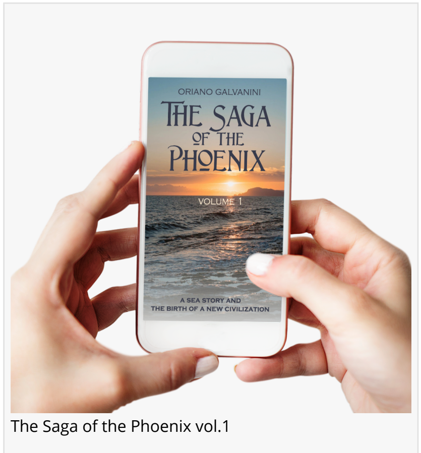
The Saga of the Phoenix vol.1

volume 2: https://www.amazon.com/Saga-Phoenix-2-IMPERIUM-ebook/dp/B09VFS8D33/ref=sr_1_1?keywords=oriano+galvanini&qid=1652776476&sr=8-1