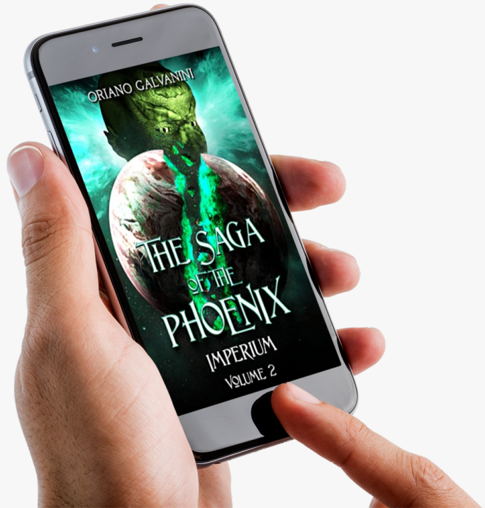
The Saga of the Phoenix vol.2

At that moment he told himself that it might be nice to tell it around, not only because that role has been part of his life for years, but also because, in those years, no ship in the world would have been allowed to sail without a radio officer on board. He therefore decided to describe and tell circumstances and events that happened on sea, seen through the eyes of the protagonist, a young radio officer.