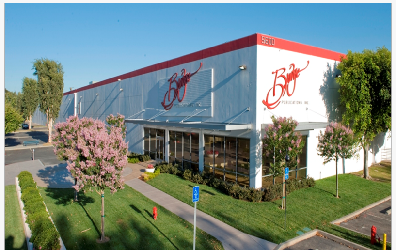
Bridge Publicagions: Publisher of New York Times and International Bestselling Author L. Ron Hubbard

COMMERCE, CALIFORNIA, USA, May 16, 2022 /EINPresswire.com/ -- "Dianetics: The Modern Science of Mental Health," the most widely read book on the subject of the human mind, was published on May 9, 1950. Appropriately, attendant to the anniversary of Dianetics, Bridge Publications was awarded a 2022 Hermes Platinum Creative Award for a special edition of the work.