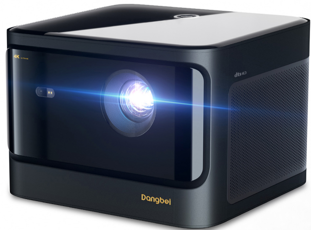
Dangbei alunching Mars Pro 4k Projector

NEW YORK, NEW YORK, UNITED STATES, May 17, 2022 /EINPresswire.com/ -- Recently Anker Nebula Cosmos 4K laser projector hits the projection world. There are several brilliant points that Nebula Cosmos 4K laser gets you. As a similar-positioned projector, Dangbei Mars Pro adopts excellent and strong features on a par with Anker Nebula Cosmos 4K laser. What are differences between these two projectors? Which one should be recommended? We will tell the difference from the main specifications and some special points of them.