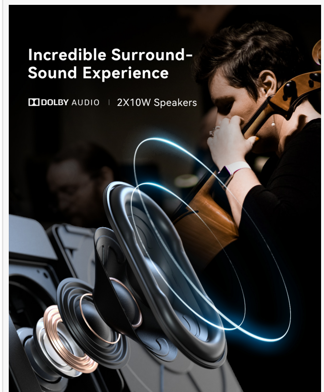
Dangbei Mars Pro 4K Laser Projector 3D Explosive map sound quality