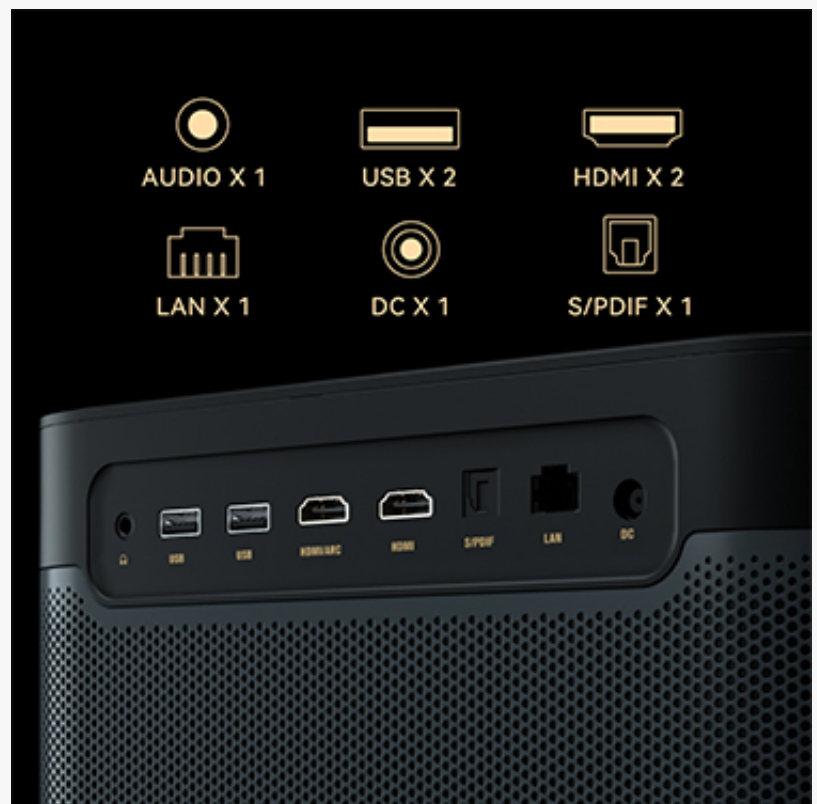
Dangbei Mars Pro 4K Laser Projector Multi-interface design