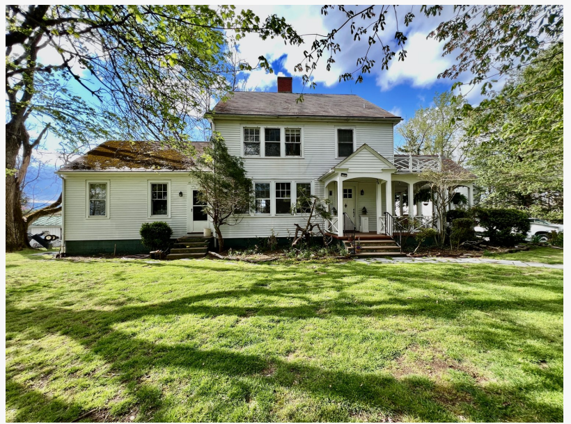
33 Hebron Valley Rd., Madison, VA 22727