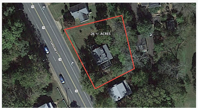
285 Caroline St., Orange, VA 22960