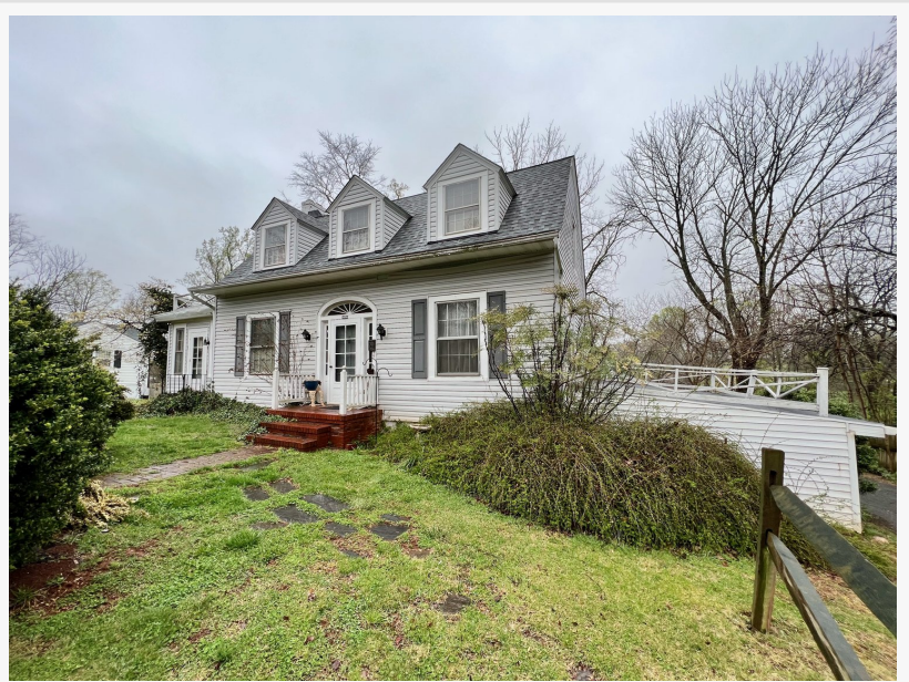
285 Caroline St., Orange, VA 22960