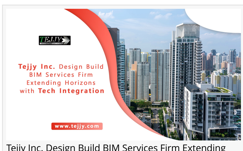
Tejjy Inc. Design Build BIM Services Firm Extending Horizons with Tech Integration

WASHINGTON DC, DISTRICT OF COLUMBIA, USA, May 17, 2022 /EINPresswire.com/ -- One of the proficient BIM services providers in USA, Tejjy Inc. design build firm in USA creates long-term rapport with clients! The competent BIM Company based in Maryland, United States strives to provide outstanding services to AEC