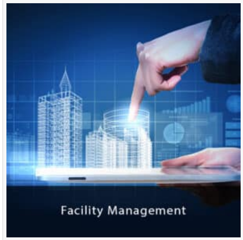
Facilities Operations and Maintenance Services

process. Competent VDC engineers and architects plan projects in the AEC business using 3D BIM models and other data. Conflict identification, construction cost estimation, risk management, and scheduling are made easier by VDC modeling in building plans.