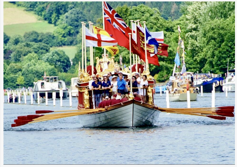
Henley on Thames a great town to visit with festivals and regattas all the year round

and ambiance of Henley to residents and visitors alike. I have no doubt all 3500 Members of Phyllis Court and their guests will be thrilled at the prospect of this great visual enhancement.'