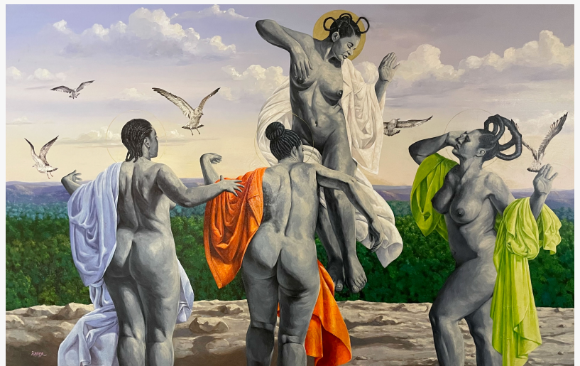
Art by Heritier Bilaka