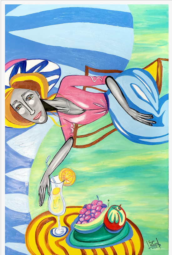
Art by Tanja Playner

With over 2 million impressions for her posts, pop art artist Tanja Playner not only creates an exceptional presence in social media, but alongside Banksy she is one of the few living artists who have shown their art at the Musee du Louvre Paris and during the La Biennale in Venezia 2019 were present with their performance. The grandson of Ferdinand Porsche - Ernst Piech was also impressed by her works of art and dedicated a solo exhibition to her. Also Ornella Muti has artwork of Tanja Playner in her own. In July 2017, Tanja Playner was ranked 11th out of more than 320,000 artists alongside Damien Hirst, Pablo Picasso, Jeff Koons, Gerhard Richter, Andy