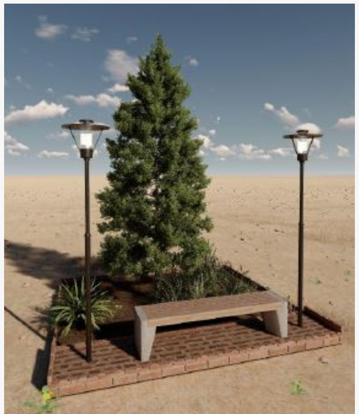
Artist conception of an individual "waffle" with smart tree technology