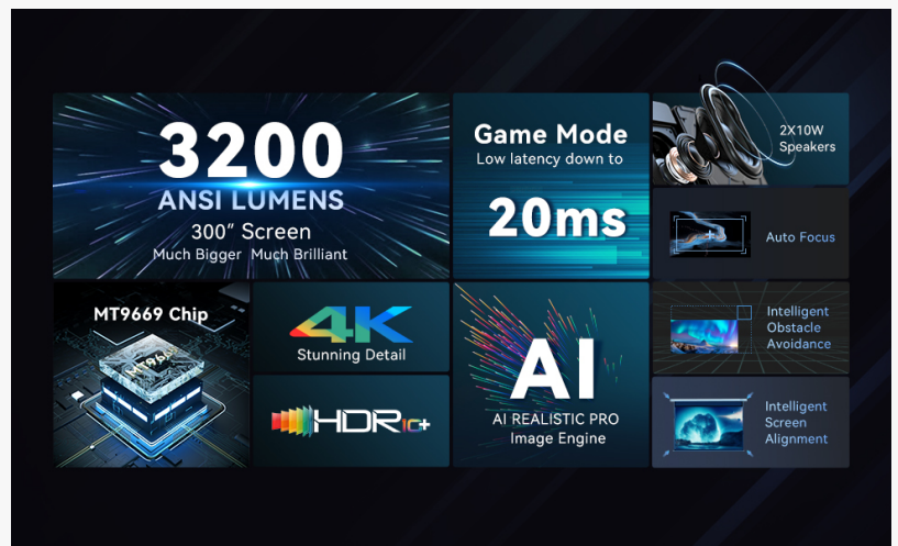
Dangbei Mars Pro 4K Laser Projector feature