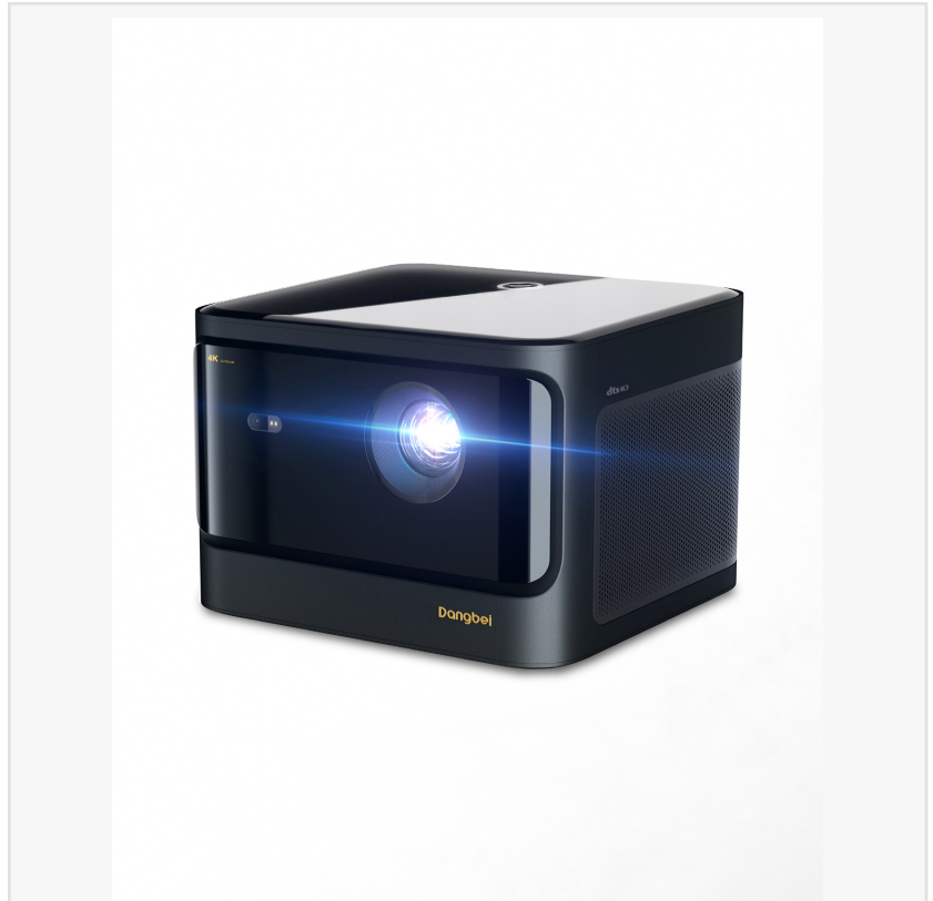
Dangbei Mars Pro 4k Projector

First things first, you need to categorize the laser projector you need in terms of usage; as to where will you be setting it up to be used. Once you have that down, the next thing you need to see is your budget for the laser projector. Are you looking for a home cinema projector, a led video projector, or simply a theater projector? There are multiple parameters on which you can decide if the projector is good and fits your needs.