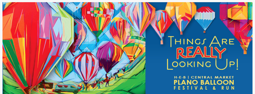
H-E-B | Central Market Plano Balloon Festival & Run

PLANO, TEXAS, USA, May 18, 2022 /EINPresswire.com/ -- The H-E-B | Central Market Plano Balloon Festival & Run will open one day early to celebrate the Plano Symphony Orchestra's 40th Anniversary Season.