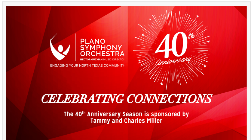
Plano Symphony Orchestra's 40th Anniversary

The H-E-B | Central Market Plano Balloon Festival & Run will be open September 22 -25 and tickets go on sale June 15. Festival admission is $10, tickets are $5 for children age 12 and under and seniors age 65 and up. A limited number of $150 VIP tickets will be available for the September 22 concert that includes a reception and reserved seating. Runner registration for the Plano Balloon Festival Half Marathon, 10K, 5K, and 1K races may be found at www.pbfraces.org . For more information please visit www.planoballoonfest.org and follow on Facebook or Instagram.