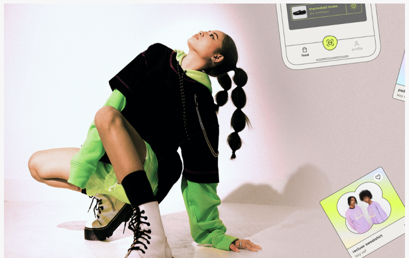
UI Duds app