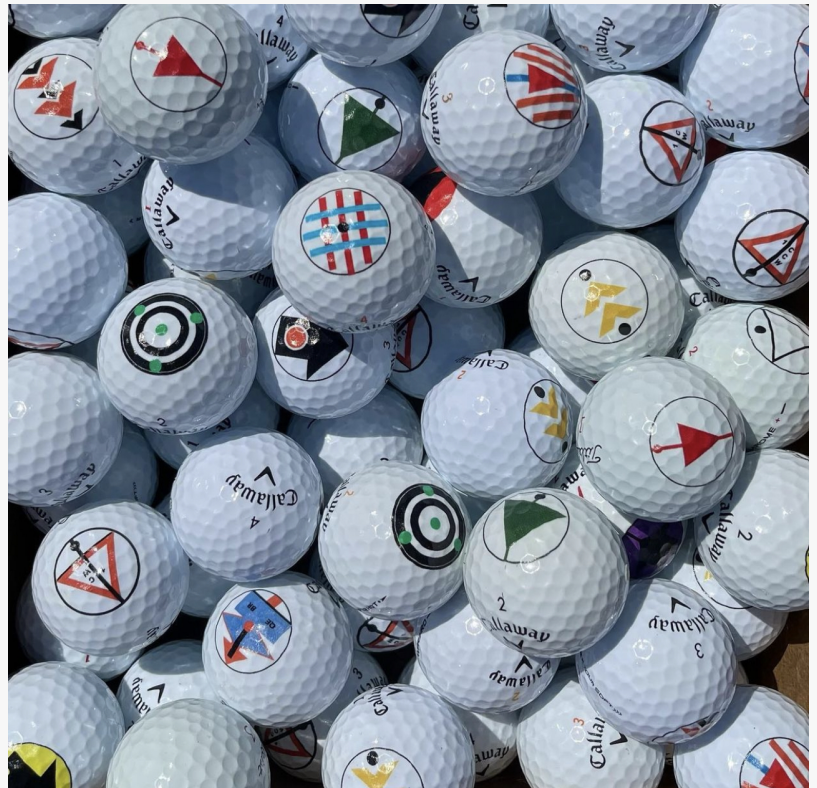
Golf Balls with various PuttTrue Markers