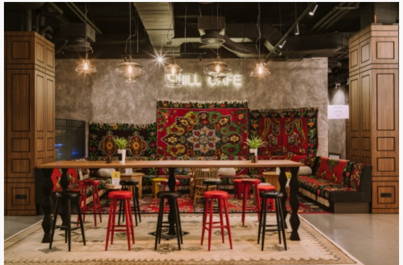
ibis Styles Sarajevo Company: MIXD Lead Designer: Piotr Kalinowski Project Location: Sarajevo, Bosnia and Herzegovina