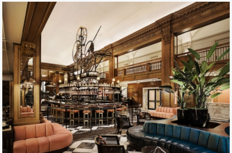
INTERIOR DESIGN OF THE YEAR – LIVING SPACE The Fairmont Olympic - Grand Restoration Company: MG2 Lead Designer: Lazáro Rosa-Violán & Pedro Gámez Project Location: Seattle, USA