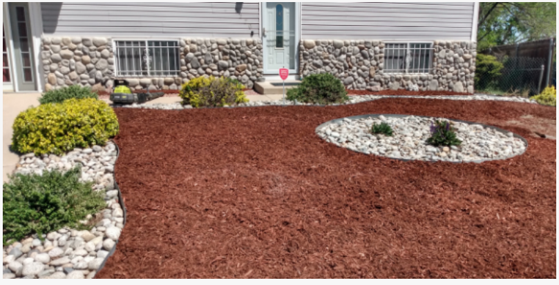
Colorado Springs Front Yard Landscaping Project

areas where the grass would not grow. The objective was to increase front yard curb appeal and