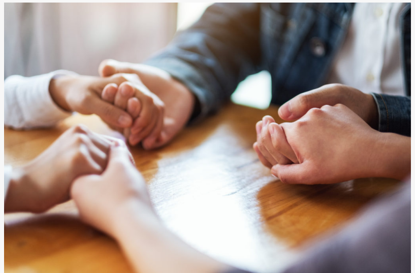
We Level Up drug and alcohol rehab for veterans is offering various forms of treatment including detoxification, rehabilitation, and psychiatric care.