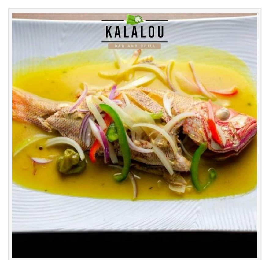
Whole Snapper ... Haitian / Jamaican style food at Kalalou restaurant

For the entire month of May, starting May 18th for Haitian Flag Day, the restaurant is offering $18 specials for all prime meals and community's favorite top sellers. One special offers 2 meals for $18 with a choice of Chicken or Griot/fried pork (Dine in or Drive Thru), and another $18 specials for all prime meals that normally cost between $25-$35 per plate. Now guests can enjoy whole Snapper, Goat,