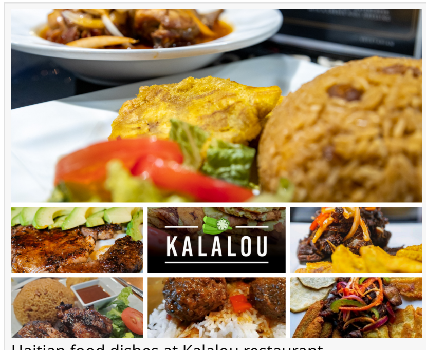
Haitian food dishes at Kalalou restaurant

Kalalou is one of the few authentic Caribbean restaurants in Central Florida offering full bar with dine-in and a take out drive-thru services for fresh "homemade" style meals instead