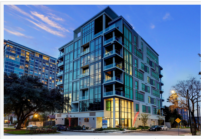
Located in a modern and luxurious complex

NEW YORK, NEW YORK, UNITED STATES, May 19, 2022 /EINPresswire.com/ -- With a modern floor plan and exquisite finishes, three units at The Mond, 5104 Caroline Street, will sell at auction this month via Concierge Auctions in cooperation with listing agent Linda Spirtos of Douglas Elliman. The three condominiums are available for auction and are all selling with a