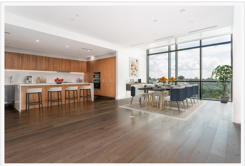
Open floor plans with abundant natural light

For more information or to view all current offerings, visit ConciergeAuctions.com or call +1.212.202.2940.