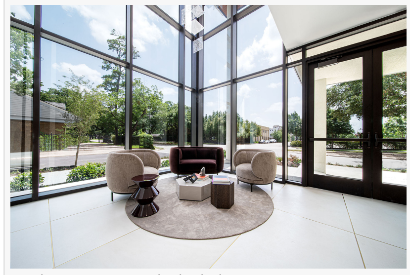
Bright, airy units with sleek design

About Concierge Auctions Concierge Auctions is the world's largest luxury real estate auction marketplace, with a state-of-the-art digital marketing, property preview, and bidding platform. The firm matches sellers of one-of-a-kind homes with some of the most capable property connoisseurs on the planet. Sellers gain unmatched reach, speed, and certainty. Buyers receive curated opportunities. Agents earn their commission in 30 days. In November 2021, Concierge Auctions was acquired