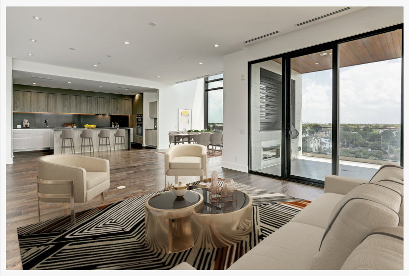
High ceilings and floor-to-ceiling windows