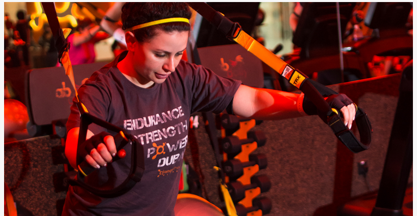
Orangetheory Transformation Challenge