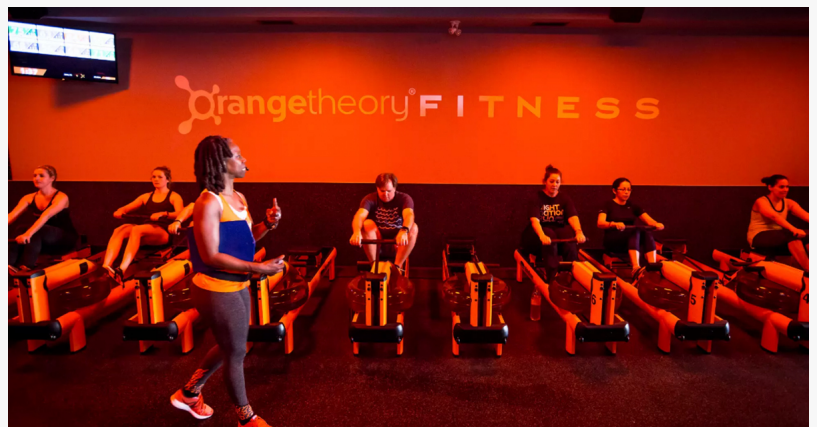
Orangetheory Fitness Center

DUBAI, UNITED ARAB EMIRATES, May 19, 2022 /EINPresswire.com/ -- Orange Theory Fitness, an international fitness brand operating in Dubai announced that Prism Digital has won a competitive bid for its marketing mandate. Prism, a leading digital marketing agency in Dubai will be managing the entire suite of ATL, BTL, and Online advertising including website development, social media management, running paid advertising campaigns as well as handling photo and video production for the brand to produce amazing local content for the region