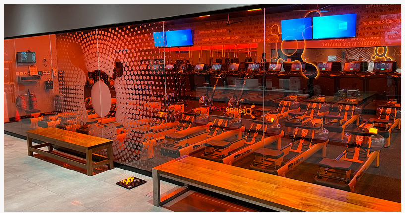
Fully Equipped Fitness Center