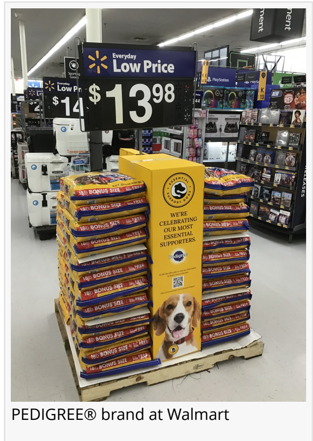
PEDIGREE ® brand at Walmart

Visit the digital magazine, Best In Class Promotion Tool Kit to see what other innovative opportunities TPG Rewards has to offer.