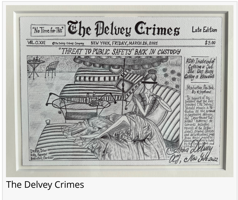
The Delvey Crimes

NEW YORK, NY, USA, May 19, 2022 /EINPresswire.com/ -- Anna Sorokin will be featuring her artwork that she created while in ICE detention. Anna's art will be on display for one night only. The event will take place on Thursday May 19 at 7:30 pm at PUBLIC Hotel, 215 Chrystie St, New York. It's the first time her work will be presented. The exhibition is on view for one night only.