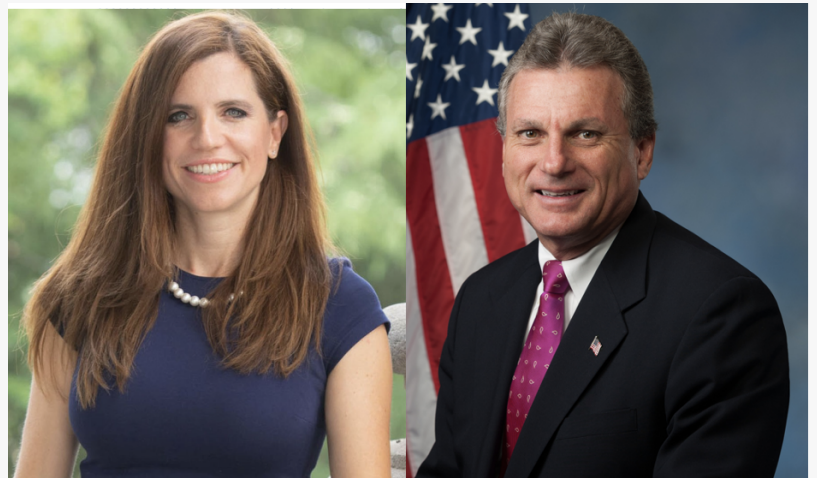
Left: U.S. Rep. Nancy Mace | Right: U.S. Rep. Buddy Carter

SAVANNAH, GEORGIA, USA, May 19, 2022 /EINPresswire.com/ -- This week, the House Energy and Commerce Committee passed the FDA Modernization Act, H.R. 2565 and S. 2952, as a rider to a larger package of FDA-related reforms, strengthening the chance of enactment this summer for a measure that would eliminate a statutory animal testing mandate for new drug development and reform our drug approval process.